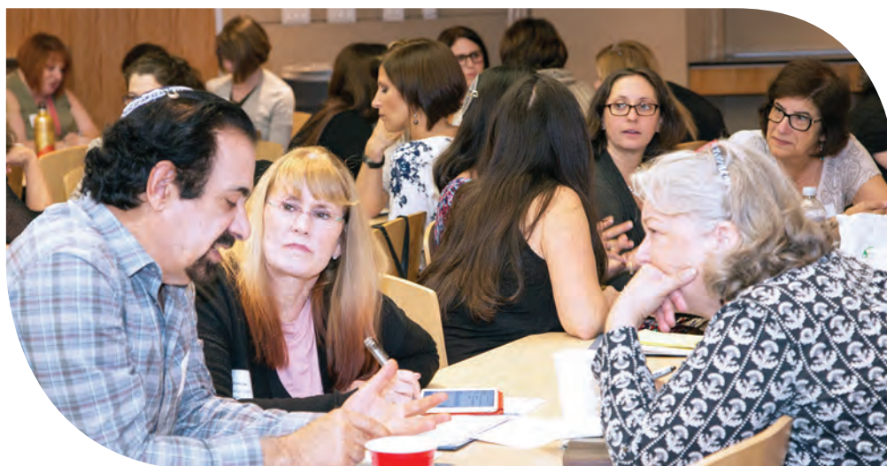
Participants in the 2017 Conference on Reinventing Religious Schools.